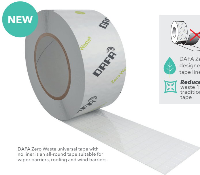
DAFA Zero Waste universal tape with no liner is an all-round tape suitable for vapor barriers, roofing and wind barriers.