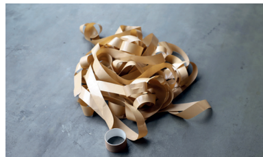
Reduce construction waste. This image shows the waste from a roll of vapor barrier tape (25 m) with liner.