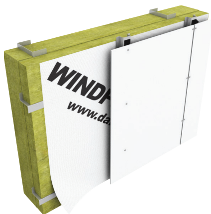
DAFA WindFoil 95 as a wind barrier in ventilated external wall cladding.

DAFA WindFoil 95 is particularly suitable for installing in constructions behind rainshields made of wood, metal, brick, etc. and can be installed both horizontally and vertically.