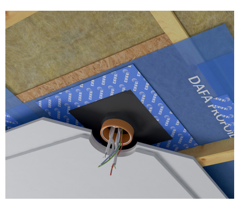
Markings Ø55 mm fits to a Ø80 mm PL-boxes.