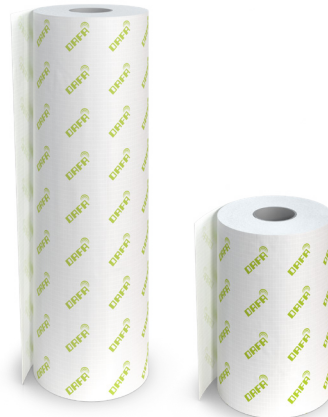
DAFA ExFoil sill foil. 500 mm or 1050 mm x 50 m