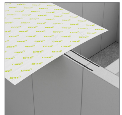
DAFA ExFoil sill foil - by the inner wall