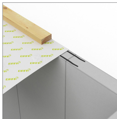
DAFA ExFoil sill foil - by the outer wall