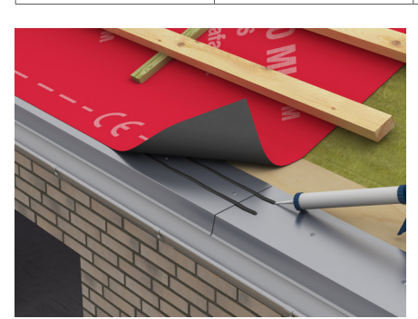
DAFA Universal Outdoor Adhesive can be applied directly to the ceiling or wind barrier. Maintains foils on both porous and smooth surfaces.