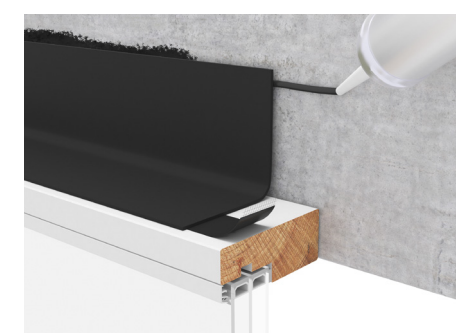
DAFA Universal Outdoor Adhesive for adhesion of EPDM membranes.