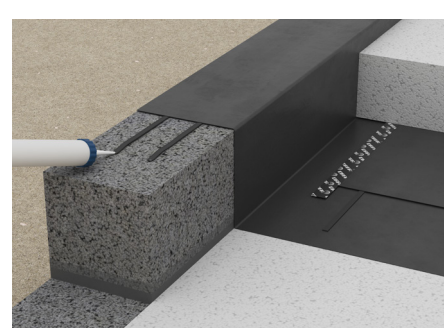
DAFA Universal Outdoor Adhesive for adhesion of wall foil.