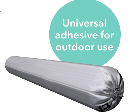
DAFA Universal Outdoor Adhesive 600 ml.