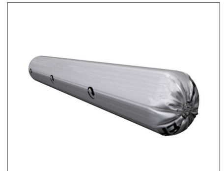
Butyl 200, bag 600 ml.