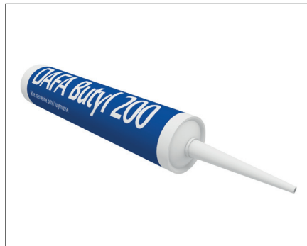
Butyl 200, tube 310 ml.

Please contact our customers service department for further information on +45 87 47 66 66